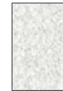
White Hammertone (WH) (N/A for RC, RBC,SM, Canopy Cabinets)