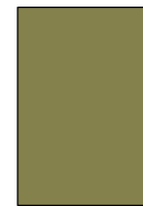
*SC Beige (SB)