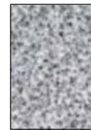
*Gray Hammertone (GH) (N/A for RC, RBC,SM, Canopy Cabinets)