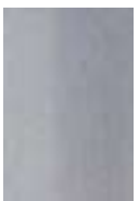
*Silver (SI) (N/A for RC, RBC,SM, Canopy Cabinets)