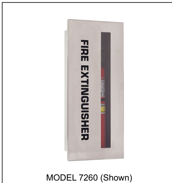
MODEL 7260 (Shown)