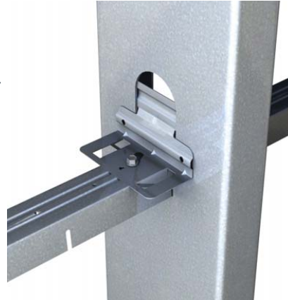
US Patent #5,904,023