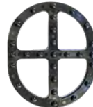
10300 - Fire Extinguisher Rust Prevention Tray Accessory