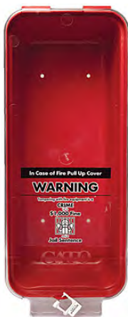
Shown as red tub with clear cover

Cato's affordable fire extinguisher series, manufactured in the U.S, provides a dent and rust proof alternative to metal. Cato's Warrior series fire extinguisher cabinet is a two- piece construction with a locking seal. No additional padlock is required. Simply pull up to break the seal and remove the cover to access extinguisher inside.